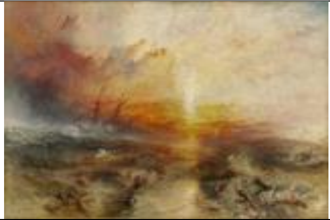
The Slave Ship J. M. W. Turner - Museum of Fine Arts, Boston (public domain image)

As in all of Foucault's work, there is no sense of a realm of freedom or liberation in these heterotopian sites. They shift and transform endlessly, opening new dangers and opportunities. Some of these varied shifts and contrasting uses of ships – both dark and light - are taken up by the German media theorist Bernhard Siegert (2015) in a perceptive reflection on the possibility of an anthropology of the ship 'as heterotopia'. In contrast to Blumenberg, who as we have seen, places the metaphor before the concept, Siegert works from 'cultural techniques' which he projects as conditions of representation, a technical a priori . In a move away from discourse analysis, he explores the 'always already', the inconspicuous technologies of our knowledge which include instruments (typewriters), language operators (quotation marks), disciplines of learning (pedagogies of reading and writing). His interest is in how the real, imaginary and symbolic are stored, transmitted and processed'.