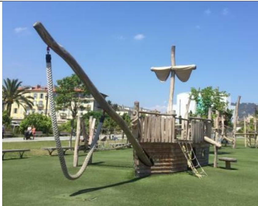
Children’s adventure ship (Nice, France).

The ship stands out amongst Foucault’s examples of heterotopia because it has become an object of excess meaning, generating endlessly rich and varied symbols and metaphors from prehistoric rituals and cave paintings through to ancient and modern literature and art. As Conrad 6 , an experienced sailor reflects: ‘the antiquity of the port appeals to the imagination by the long chain of adventurous enterprises that .... floated out into the world...’. In this short essay, I will draw upon mainly Western seafaring literature and ancient myths to explore why ships and boats might be claimed as the prime example of Foucault’s puzzling and enigmatic spatio-temporal concept. The essay will explore: the wide and diverse metaphors of seafaring; the relationship between ships and other heterotopias; and the multiple shifts and transformations of the ship, both mythical and real.